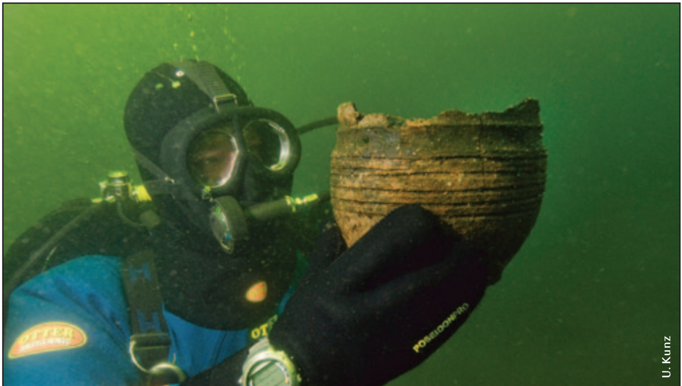
Slavonic pottery from the Great Eutiner Lake